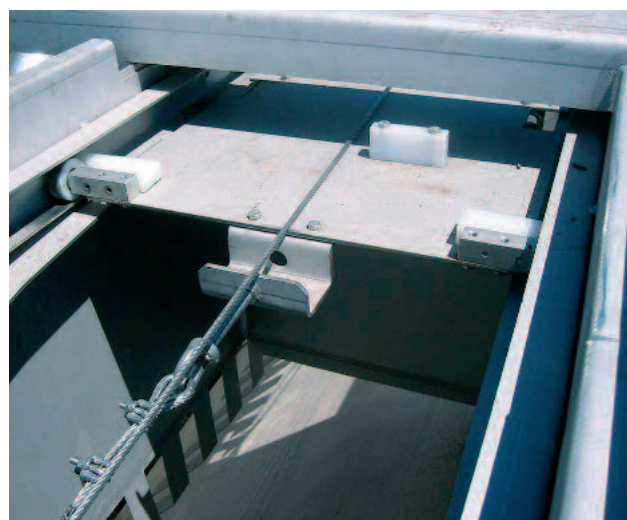
Semi-automatic grease removal by means of a paddle system